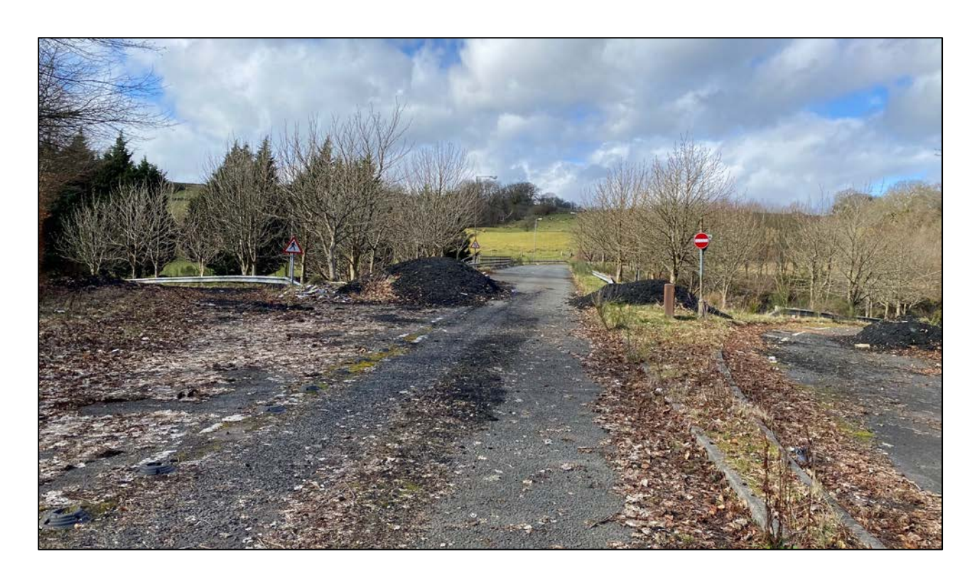
Access to the site from the grade separated junction on the A78

A Framework Sustainable Transport Strategy (STS) and Framework Travel Plan have been provided within the supporting documentation and detail general outcomes including; the proposed re-opening of the IBM railway station; an internal layout designed to encourage sustainable travel, providing the ability to accommodate buses; a new pedestrian link between the proposed development and Braeside; and the upgrade of the eastern development access offering a safe crossing point.