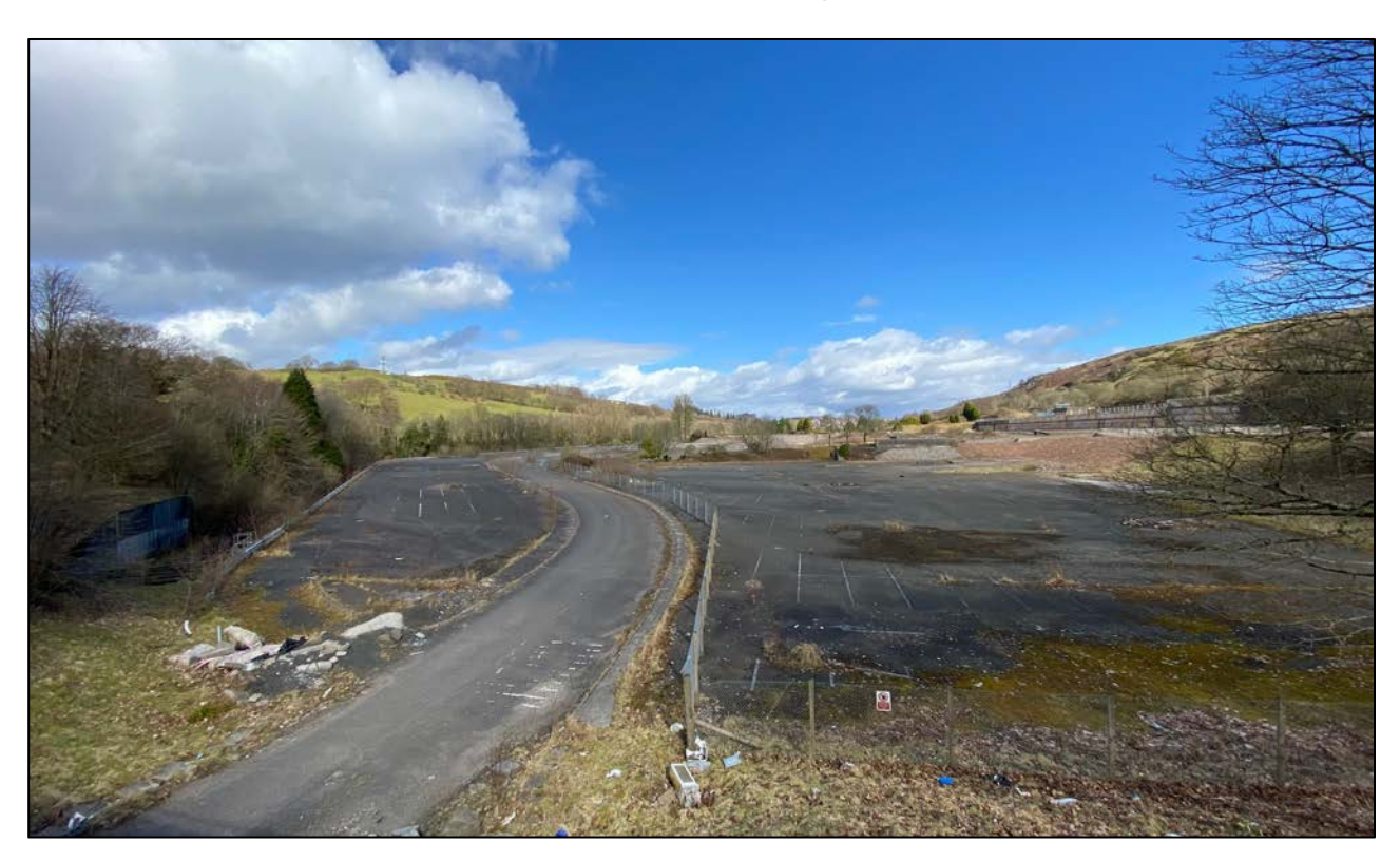
View looking north across the site

SEPA has no objection in principle to the proposal. It specifically notes that the FRA recommends that the existing headwall is retained, or replaced with a headwall 48.5m AOD so that the culvert will surcharge, but not flood the site. Considering whether the daylighting of the watercourses may result in an increase in floodwater downstream of the development, SEPA notes that when considering flood risk for the site, the FRA has taken a conservative approach and not taken into account any attenuation by the basin that is near the culvert. Once this attenuation is considered, the FRA states that the detention storage of the landscape is likely to offer a reduction in flow peak reaching the adjacent reach of Spango Burn. SEPA is generally in agreement that there is unlikely to be an increase in flood risk downstream as a result of the development.