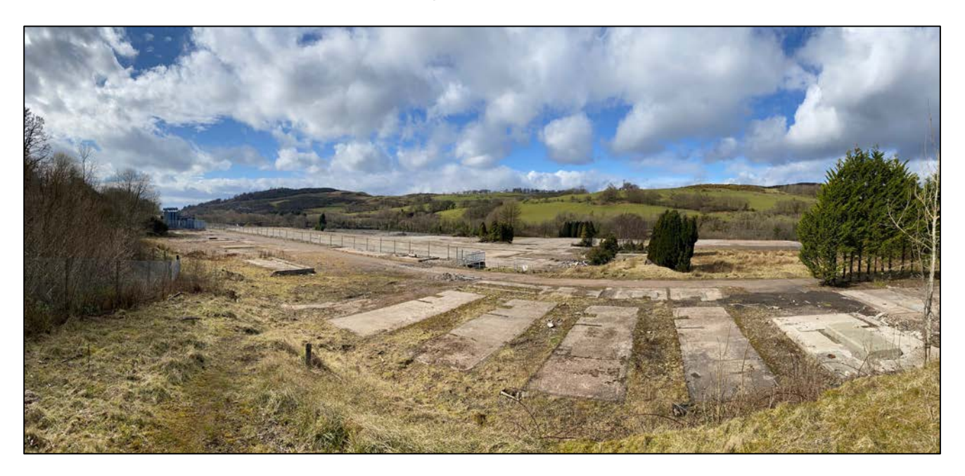
Looking west across the site from the path to the station

Whilst this potential impact is noted, the funding of healthcare is an issue for others. GP practices for example are often run as individual businesses who make a business case to expand and establish the practices. Given the development would be phased over a 10-year period and that the application site forms part of an identified redevelopment opportunity within the adopted and proposed LDPs, it is considered that local healthcare providers have sufficient opportunity to anticipate and phase any business cases to take account of the development.