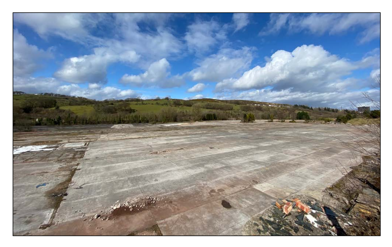
View looking north across the site towards the A78

the proposed percentage split of uses also fails to accord with the preferred strategy set out within both the adopted and proposed LDPs and respective draft Supplementary Guidance. Based on the indicative proposals the development would also see the entire expected residential development capacity for the wider Priority Place as identified in the proposed Local Development Plan on just part of the site.